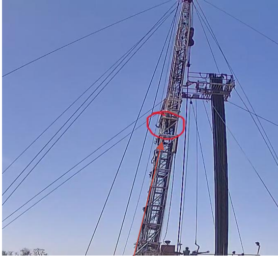
Approximate position from where the deceased fell down