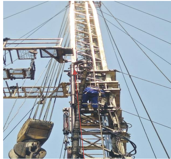
Gooseneck with Kelly hose obstructing the monkey ladder.